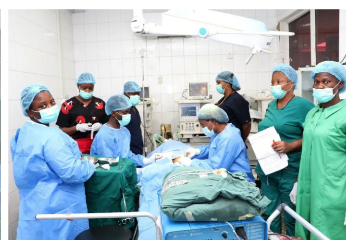
LASUTH Surgical team at work during the Surgical Mission for 50 Indigent Paediatric Patients