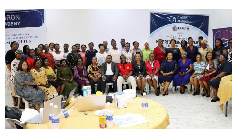
Participants and facilitators during the workshop for Nurses on Modern Management Asthma and Hypertension in LASUTH, 6th of September, 2023